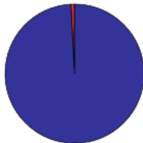
Natural uranium (NU) >99.2% U-238 ≤0.72% U-235

How Do You Keep The Nuclear Bomb Stable Until You Re Ready To Use It (For Examp