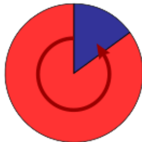
Highly enriched uranium (HEU) (weapons grade) 20-85% U-235 (≥85% U-235)